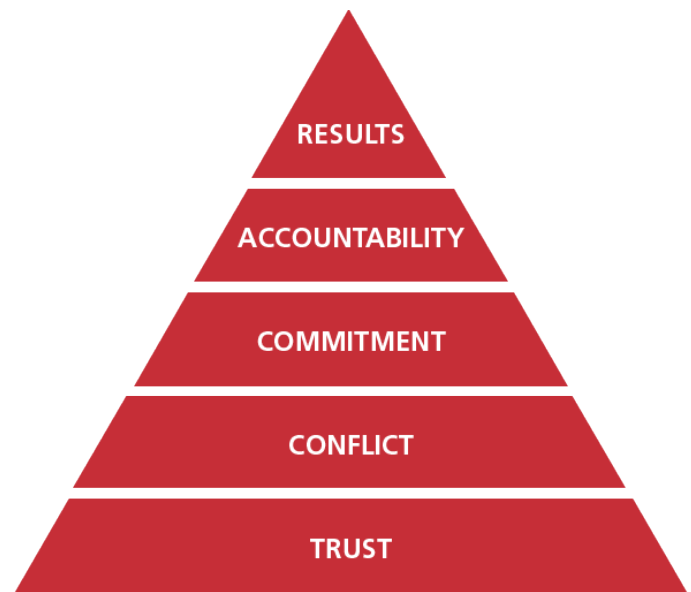
The Five Behaviors of a Cohesive Team™ Model

97% of participants reported that The Five Behaviors of a Cohesive Team will help their team perform better!